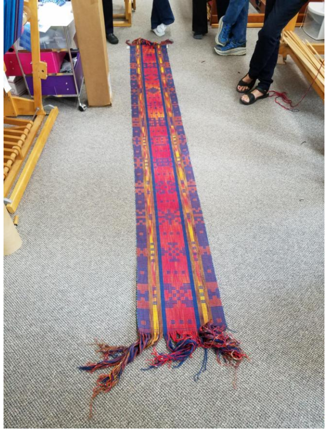
Gorge Hand Weavers Guild's weavings